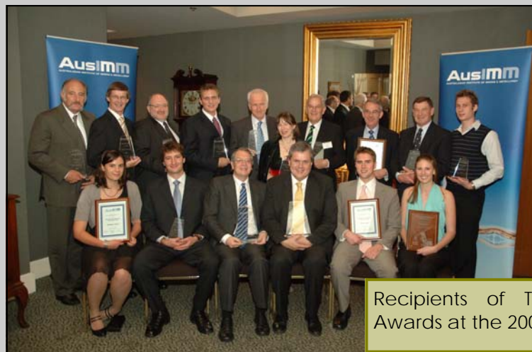
Recipients of The AusIMM Awards at the 2008 Dinner

http://www.ausimm.com.au/content/default.aspx?ID=258